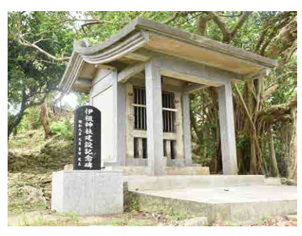
Iso Castle Site

This is part of the Nakagamiho Seikaido, a roadway that extends from Shuri to the Yomitan area. The king crossed this bridge to visit Futenma Shrine. It is believed that the section of cobblestone road which includes Ahacha Bridge was built under the command of King Sho Nei in 1597, when the roadway between Urasoe Gusuku and Shuri was constructed. Two stone bridges were built across the kowan River, the north bridge and the south bridge. Although the south bridge was destroyed during the Battle of Okinawa, it was reconstructed in 2006.