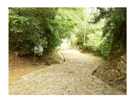
Toyama Stone Road

Also called "Hanariji," Wakariji is a massive rock that stands a short distance from the Eastern edge of Urasoe Hill. This behemoth of a rock can even be seen from southern and central areas of Okinawa, and it has become a landmark of Urasoe. At the base of Wakariji lies a place of worship which is still frequented by pilgrims today.